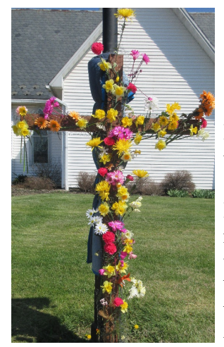
Cross Decorated for Easter

Once that task is completed PNC will begin reviewing Pastor Information Forms (PIF) which have been completed by perspective pastors listing their strengths and gifts. These will contain (Continue on page 2)