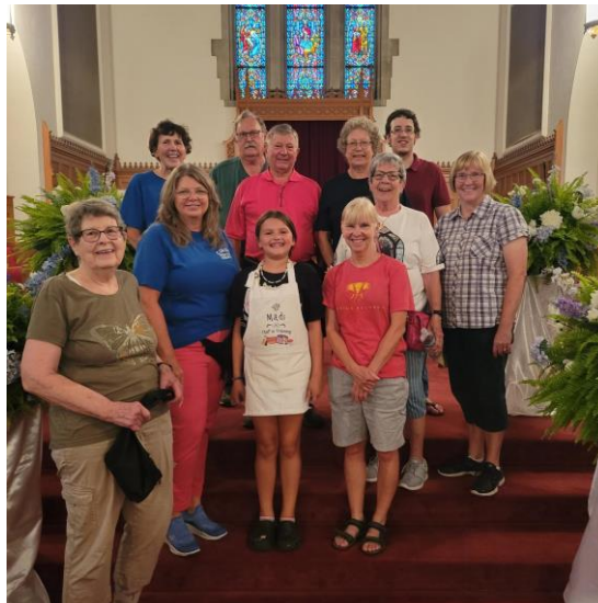
Reference Left text box