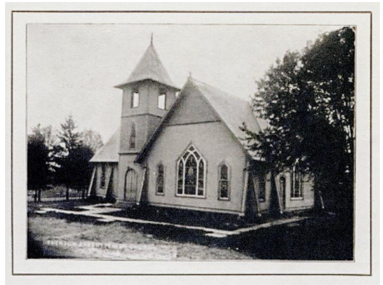
Trenton Presbyterian Church

one moving the entrance more to the center of the north wall. The addition on the west side meant the chancel had to be moved to an alcove built in the south wall. Seating was changed to face the alcove. The new entrance is behind the congregation. Stained glass windows were replaced by memorial stained glass windows. Three large window combinations on the east wall were replaced with the Jesus in the Garden of Gethsemane window.