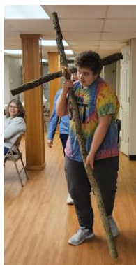
carry the cross