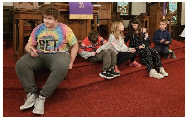
Stop #7 Listening to scripture