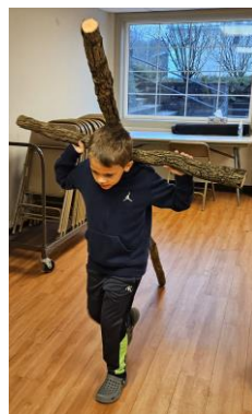
carry the cross