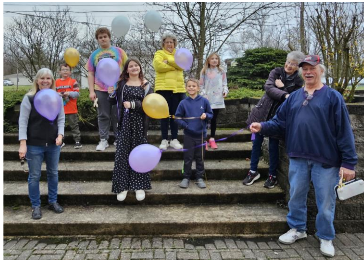
Stop #7 The Ascension

Five youth met at Condit on Saturday, March 6, to go on a "Road Trip." Their destination was Easter. Seven stops were planned along their journey, representing events that happened to Jesus during Holy Week. Each stop was explained through scripture and had an activity paired with the scripture to reinforce the message.