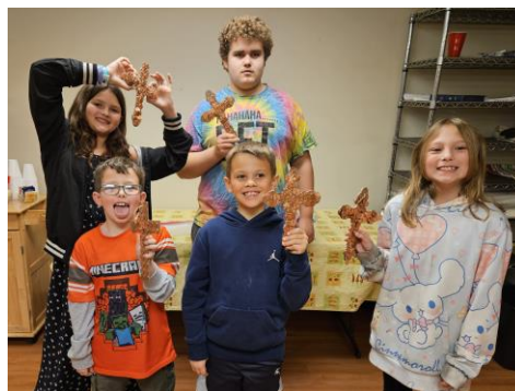
"Paid in Full"