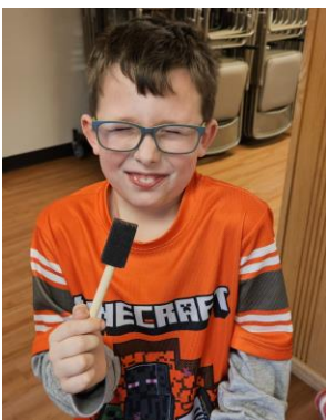
Stop #5 Golgotha Vinegar on sponge