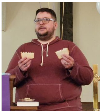
Stop #2 The Upper Room Communion