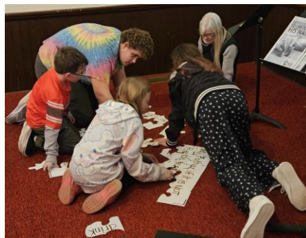
Stop #3 Garden of Gethsemane Prayer Puzzle