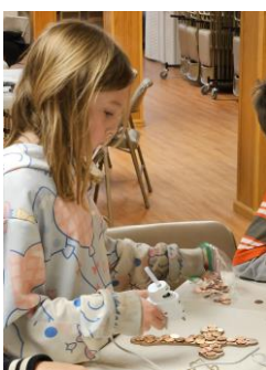
Stop #5 Golgotha