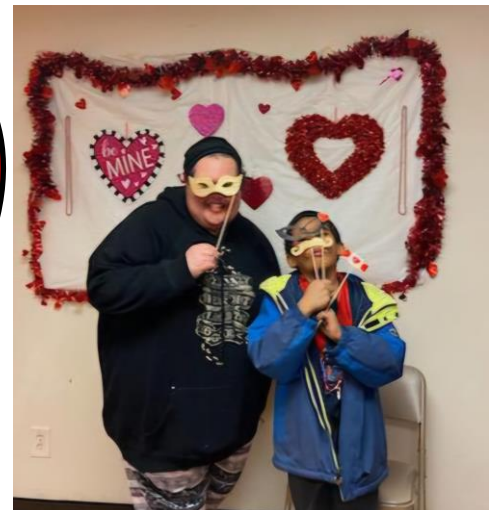
Visitors to Condit