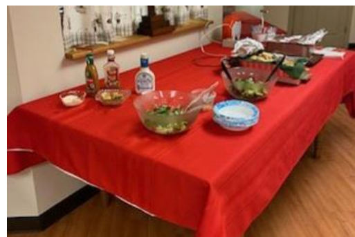
Dinner displayed on a festive red tablecloth