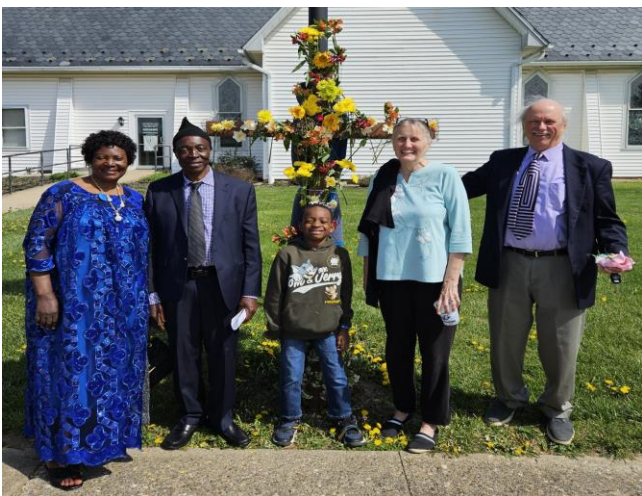
Congregants paused by the flowered cross to take pictures when exiting the church grounds.