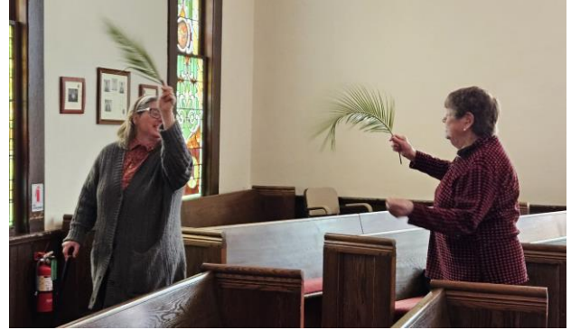
We were dancing.....