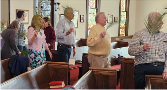
We were marching.....

Palm Sunday Instead of opening Palm Sunday service with a procession of palms the service was instead closed to the beat of a drum while singing the South African song, Marching in the Light of God , and waving palms.