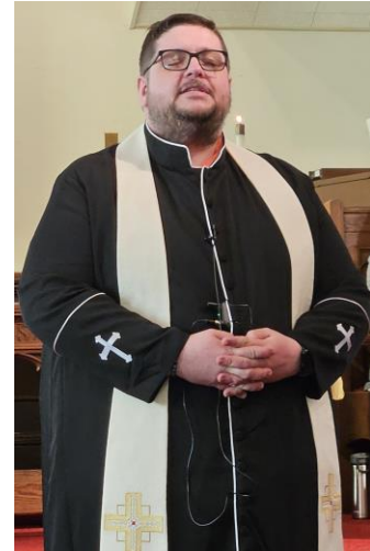
We were praying....