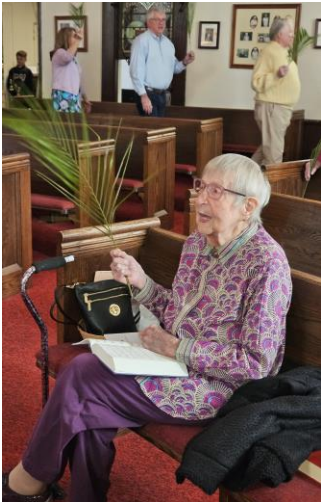
We were singing.....