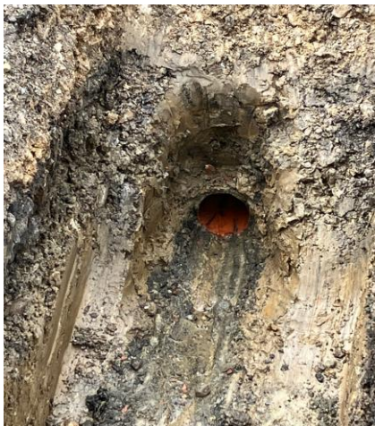
Top photo, damaged drainage tile

Trustee President George Justice took the top photo ( below ) of the 4 in. tile shortly after county crews unearthed it last week. The tile, they said, was crushed where it was cut into the 6 in. clay tile in the road right-of-way, about 3 ft. below grade.