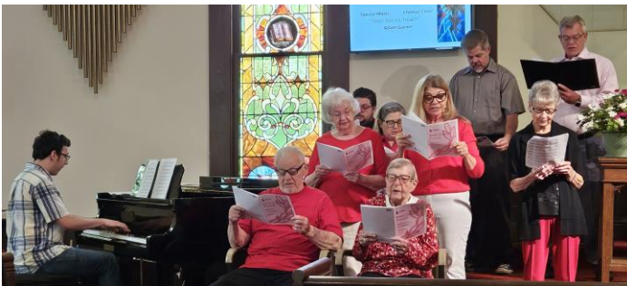
Condit Chancel Choir singing on Pentecost Sunday 2025

Pentecost Sunday, June 8, found many wearing red. The choir was particularly "on fire for the Lord" as they sang "Peter Gonna Preach." The Editor thanks them for their weekly dedication and willingness to serve the congregation with their gift of music.