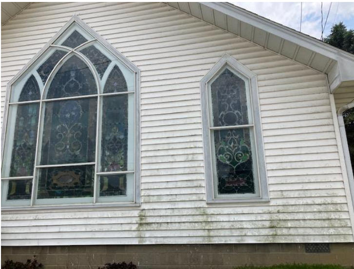
Church before washing