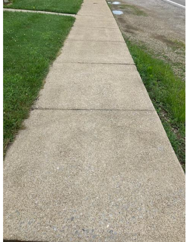
Sidewalk after washing