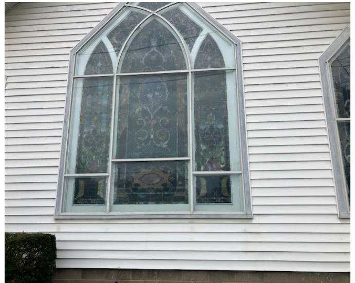
Church after washing