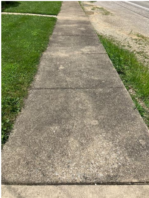
Sidewalk before washing