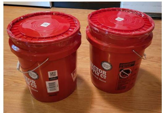
Church World Service Emergency Cleanup Buckets

The CWS cleanup Bucket collection is complete. Twenty four items needed for disaster cleanup were packed in two 5 gallon buckets. Condit came through again, donating all the necessary products. And somehow all the clotheslines, brushes, soap, cloths, sponges, pads, gloves, and masks fit in the buckets! The cost for shipping was $3 and was included in the buckets. The buckets will be delivered to Scioto Valley Presbytery for them to outsource.