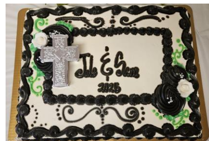
The Wedding Shower cake.